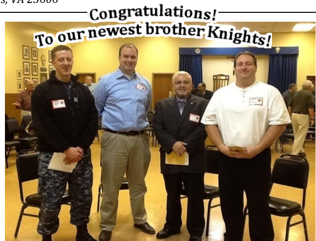
December 10 th