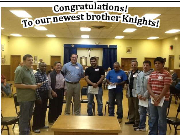
September 24 th

Notes: The session will be held in Downer Hall at the Knights of Columbus Walter Pollard Council #5480, 12742 Nettles Drive (Columbus Way), Newport News, VA 23606